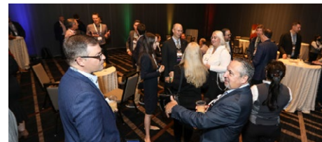
EXHIBIT SPACE IS LIMITED. RESERVE YOUR TABLE TODAY!